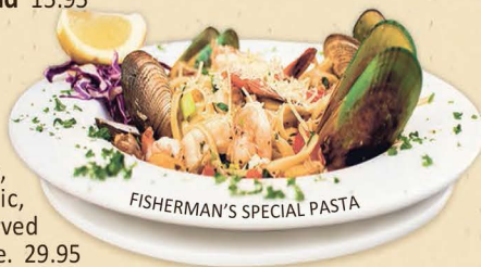
FISHERMAN'S SPECIAL PASTA